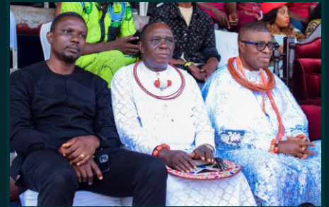
Dignitaries present at the Oke Umurhohwo Football cup 2020 Finals