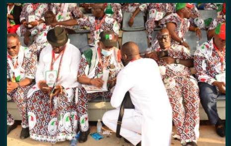
With Dignitaries at the PDP National Convention